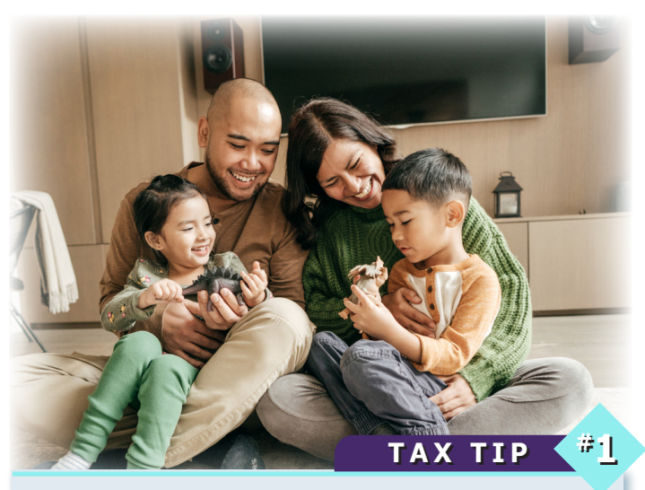
Using the Standard Deduction for 2022 may be better than itemizing deductions. However, if you still itemize deductions be sure to keep detailed records.

Those who adopt a child can receive a tax credit of up to $14,890 for qualified adoption expenses in 2022, subject to income limitations (see page 11). Those adopting a child with special needs may claim a $14,440 tax credit in the year the adoption is completed, even if they do not have qualified adoption expenses.